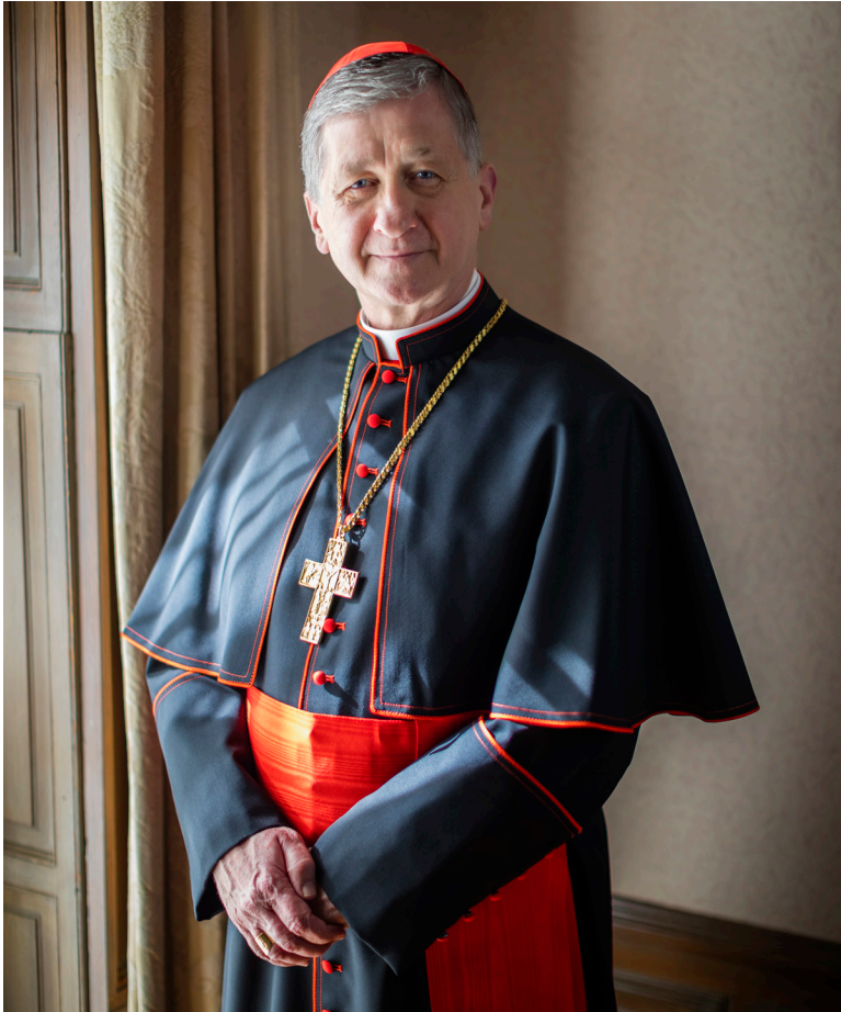
Cardinal Blase Cupich Archbishop of Chicago